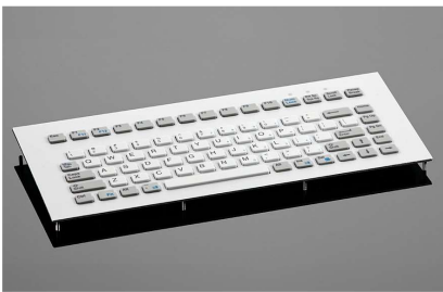
DS83S with Bolts

We offer this keyboard in different variants. Are you interested in any of the following solutions? Just get in touch with us.