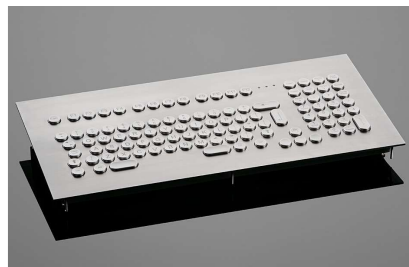
102T-ES Finger Mouse