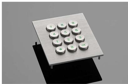
12T-ES19 with Backlight