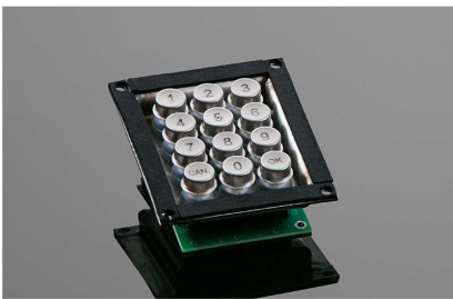
12T-ES w/o Front Panel

Here is a selection of similar keypads. Are you interested in any of the following solutions? Just get in touch with us.