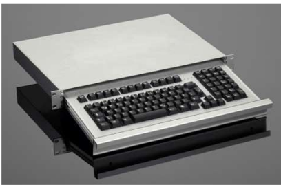
DS 104W Drawer

Here is a selection of other drawer keyboards. Are you interested in any of the following solutions? Just get in touch with us.