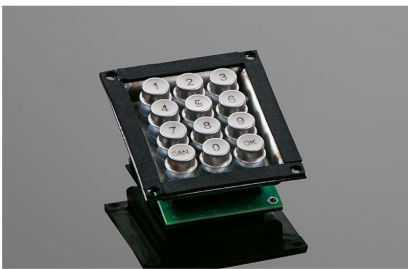
12T-ES w/o Front Panel

Here is a selection of similar keypads. Are you interested in any of the following solutions? Just get in touch with us.