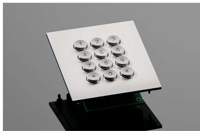
12T-ES w/o Backlight