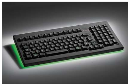
DS104W with Backlight