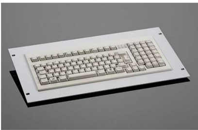
DS104W Built-in version

We offer this keyboard in different variants. Are you interested in any of the following solutions? Just get in touch with us.